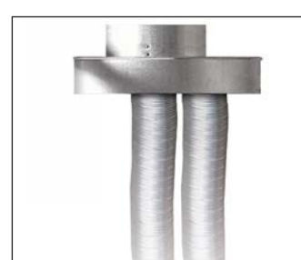
Transition piece with flexi flues attached