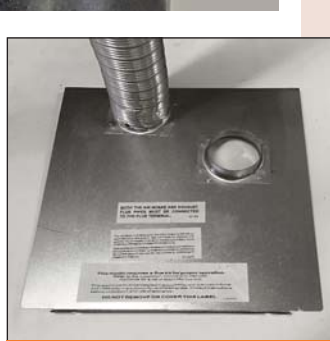
Ensure Flexi-Flues are firmly affixed