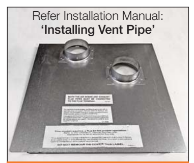
Remove plate from top of unit, ready to fix Flexi-Flues