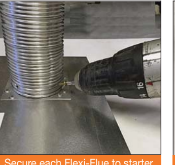
Secure each Flexi-Flue to starter collar with 3 self-tapping screws