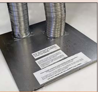
When both Flues are secured to starter collars, replace plate onto top of unit

When the flexi-flues are attached to the starter collars, you can fix the transition piece to the 750mm gal flue using 3 self-tapping screws