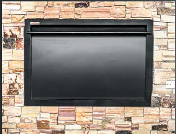
Pictured: Jetmaster built in BBQ & outdoor fire with closed door