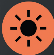
OPTIONAL LIGHT FITTING