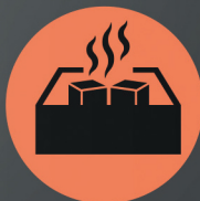
CHARCOAL STARTER TRAY