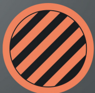
NICKEL PLATED GRILL