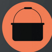
CAST IRON STEWING POT HOOK